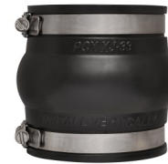
Rubber Expansion Coupling